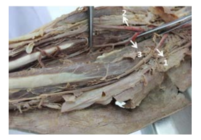
Figure 1. The volar aspect of dissected elbow and forearm region 1: Ulnar artery; 2: Radial artery; 3: Common interosseous artery

Several reports described the variations in the arterial plexus of the upper limb and hand [1, 6, 9]. Bilodi et al. reported the variation in right upper limb, the brachial artery terminated into ulnar and radial arteries [10], and the common interosseous arteries arising from the radial artery, but not from ulnar artery [11]. Similar cases were reported in other literature [12, 13]. The axial artery in the developing limb bud includes both subclavian and axillary arteries. The origin of anomalies in the branching pattern of the upper limb buds is attributed to the defects