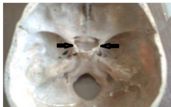
Figure 2. Ossified caroticoclinoid and interclinoid ligament (complete caroticoclinoid foramen)

The present study reported a bilateral completely ossified CCL in a dry skull of a woman obtained from the