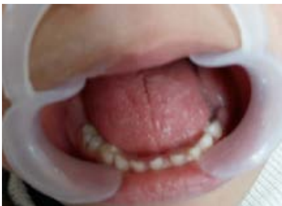
Figure 1. Intraoral view of the patient.

The etiology of tooth impaction includes systemic and local factors such as dental germ abnormality, eruption cyst, odontoma, tooth displacement, ankylosis, gingival hyperplasia, and eruption space deficiency [3]. The general treatment recommendation is to await normal exfoliation of infraoccluded primary molars. Continuous supervision of occlusal development and periodic radiographic control of normal root resorption are recommended, too. In special cases of occlusal disturbances