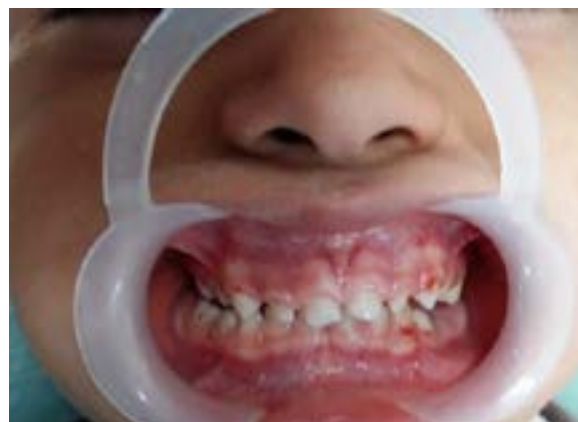
Figure 2. Occlusal view of the patient.